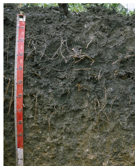
Deep, friable, fertile clay loam with non-restrictive subsoil — ideal for vegetable crops

Further information can be found in Assessing Agricultural Land (Maschmedt 2002).