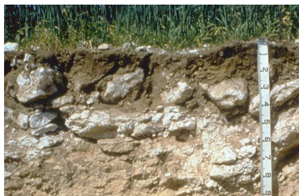
Calcrete often overlies sodic and highly calcareous materials, or tight heavy clays, all of which limit potential rootzone depth

Soil and land attribute maps display a simplified version of the underlying data. Mapping classes are based on soil landscape map units, within which rootzone depth potential can vary. Map units are classified according to the estimated potential rootzone depth of the component soils, on a weighted average basis. Variations from the mean can be significant, so legend categories should be considered as indicative only.