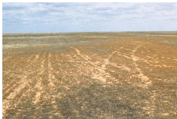
Non-watertable salinity magnesia patch

Soil and land attribute maps display a simplified version of the underlying data. Mapping classes are based on an interpretation of soil landscape map units, which are classified according to the area proportion affected by magnesia patches.