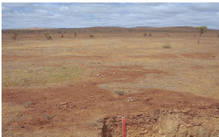
Shallow calcareous loam soil with sporadic scalding

Soil and land attribute maps display a simplified version of the underlying data. Mapping classes are based on an interpretation of soil landscape map units. In this mapping of Scalding , map units are categorised according to the estimated area proportion of affected land.