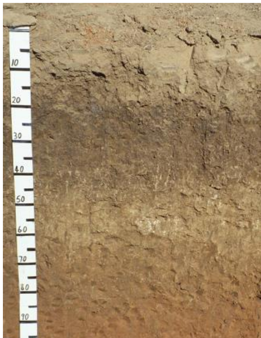
Toxic boron levels (22 mg/kg from 15 cm) restrict root growth

deeper into the soil. Excess boron cannot be removed from soil or treated in any way under dryland farming conditions. Accidental or deliberate breeding for boron tolerance has produced a range of cultivars which are appropriate for affected soils.