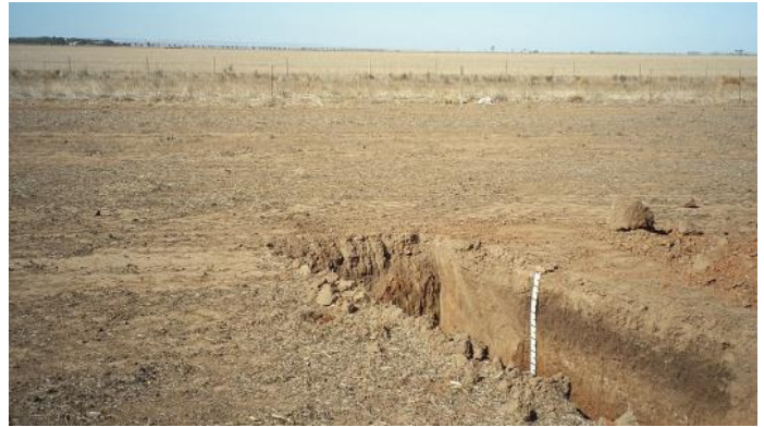
Land affected by boron toxicity

Soil and land attribute maps display a simplified version of the underlying data. Mapping classes are based on an interpretation of soil landscape map units. Each map unit component is assessed according to the average estimated depth to toxic boron (i.e. concentrations exceeding 15 mg/kg). Legend categories are then based on the proportion of each map unit where this occurs within the upper 100 cm of soil.